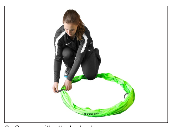
6. Secure with attached velcro.