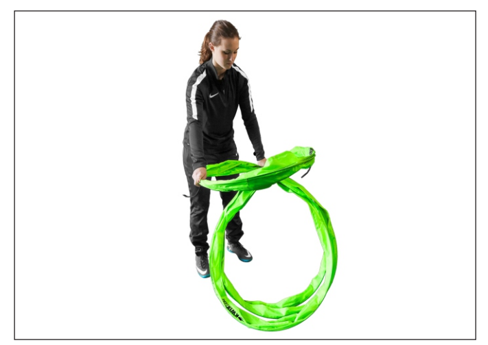
5. Repeat steps 2 and 3 a second time.