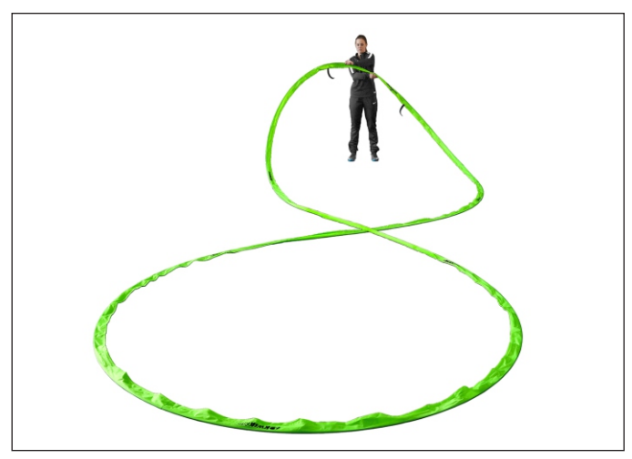
2. Cross arms to form a figure 8.