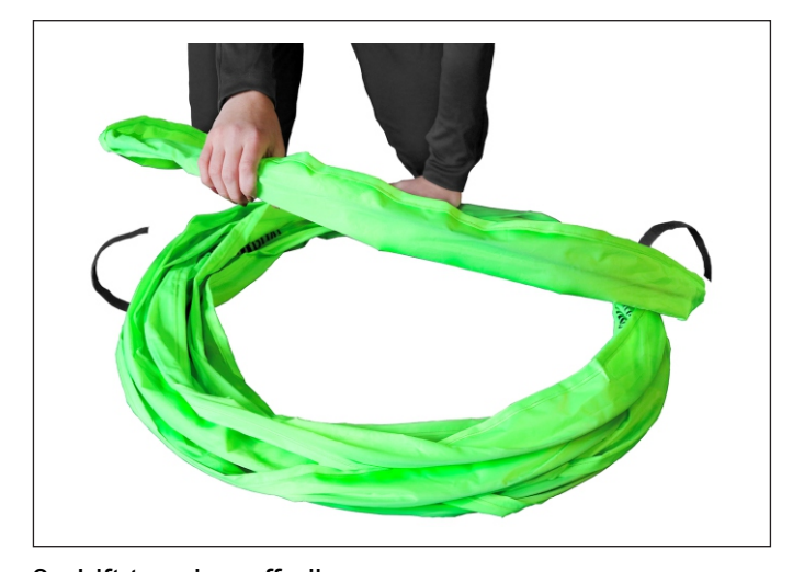
3. Lift top ring off pile.