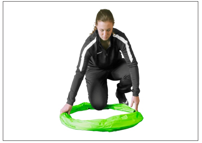
1. Place ring on ground and hold in place with knees.

Use caution when opening rings. Rings are spring loaded and will abruptly open. Warn bystanders before opening velcro straps.