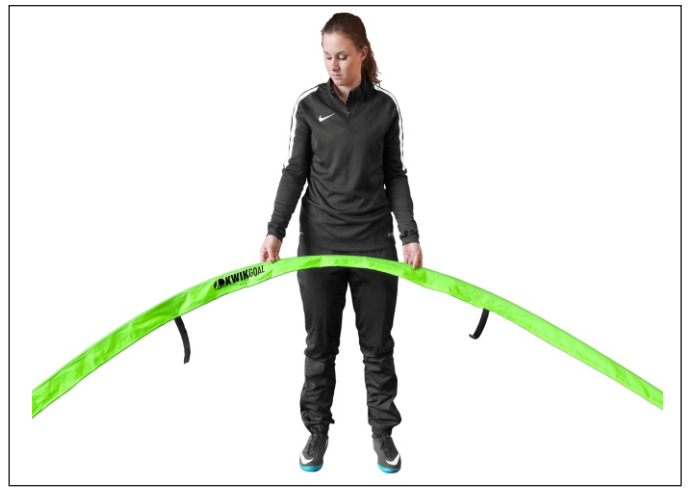
1. Position yourself outside of the ring. Grasp the ring with both hands.