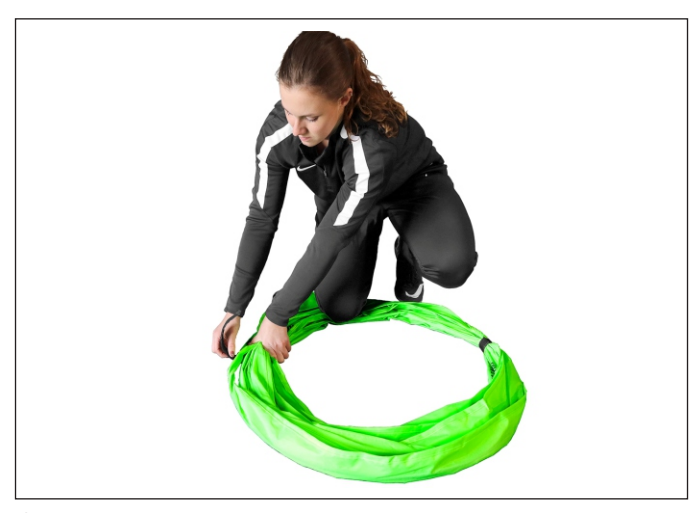
2. Loosen velcro straps.