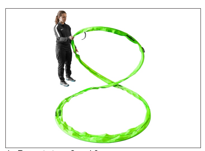
4. Repeat steps 2 and 3.