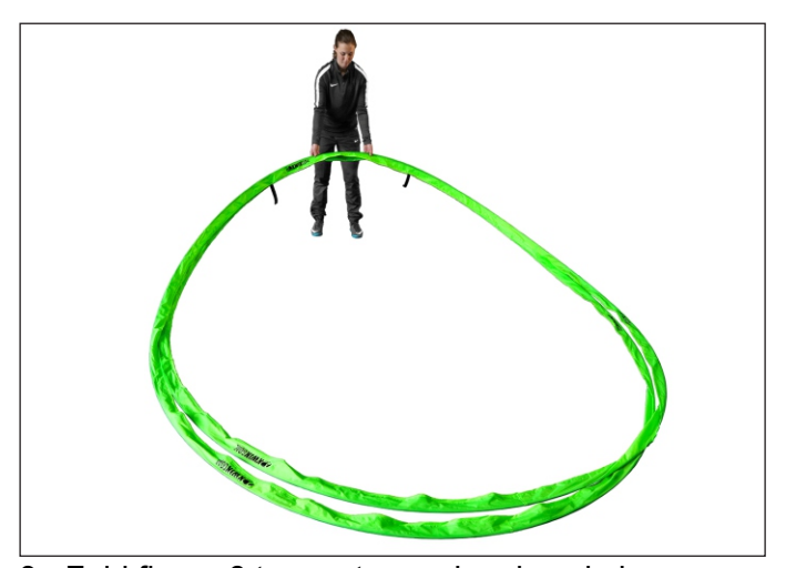
3. Fold figure 8 to create overlapping circles.